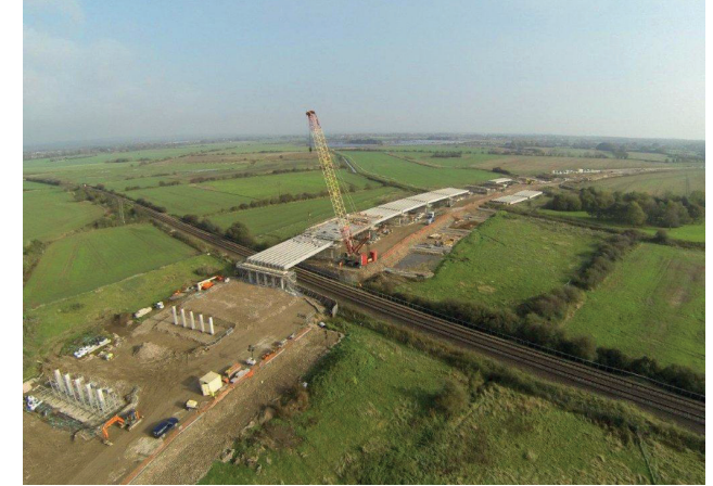
▲ A new viaduct under construction as part of the Bognor North Relief Road (BNRR)

Enterprise Bognor Regis is a 70 hectare commercial and employment development opportunity located on the northern edge of Bognor Regis in West Sussex. It has the potential to accommodate 150 businesses and provide 4000 jobs.