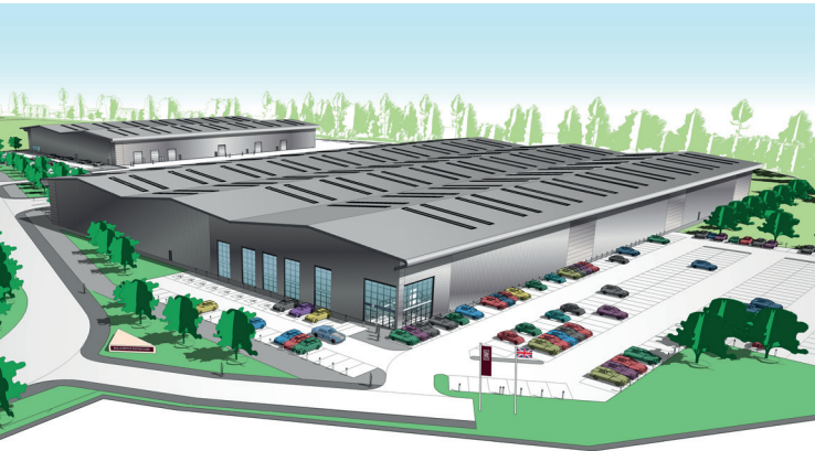
▲ The new Technology and Logistics Centre for Rolls-Royce Motor Cars

Rolls-Royce Motor Cars have been the first to take advantage of this premier business location. They have recently been given planning permission to build their new 30,000 m 2 Technology and Logistics Centre on Oldlands Farm. Work has started on site and they expect to occupy from early 2016.